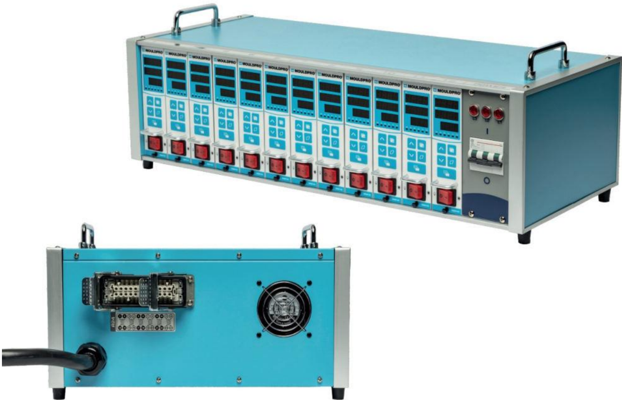
Wiring Connector Assignment example (24 x 1)