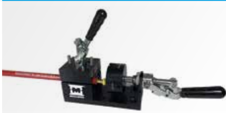
55 HOSE ASSEMBLY TOOL