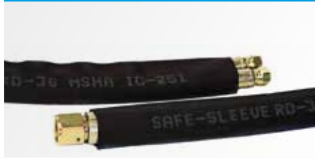
52 HOSE PROTECTION