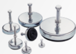
236 MACHINE MOUNTS