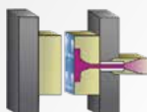
231 MOULD ALIGN