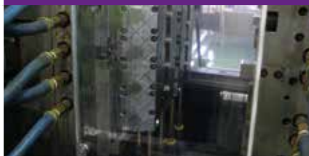
231 MOULD SCREENS