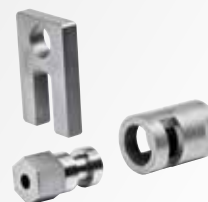
232 EJECTOR COUPLING