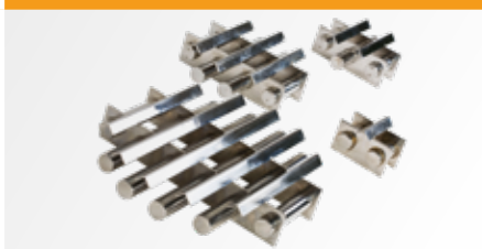
159 HOPPER MAGNETS