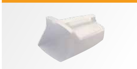
159 MATERIAL SCOOPS