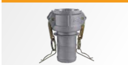
155 CAMLOCK COUPLINGS ALUMINUM