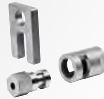
224 EJECTOR COUPLING