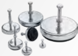
228 MACHINE MOUNTS