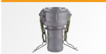
147 CAMLOCK COUPLINGS ALUMINUM