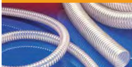
143 LOADER HOSES