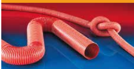
145 HOT AIR HOSES