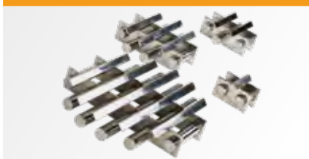
151 HOPPER MAGNETS