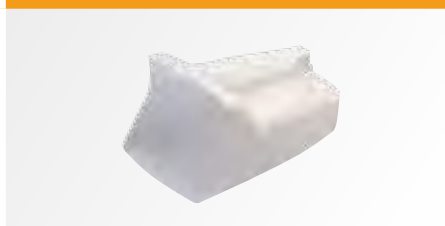
151 MATERIAL SCOOPS